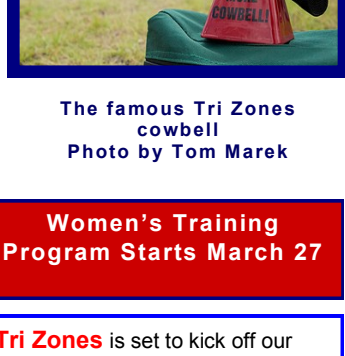
The famous Tri Zones cowbell